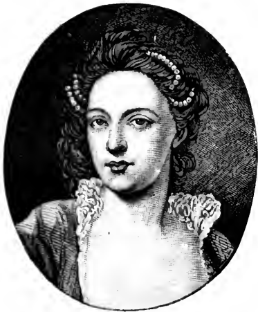
ANNE FARQUHARSON, LADY MACKINTOSH — 1715-6.